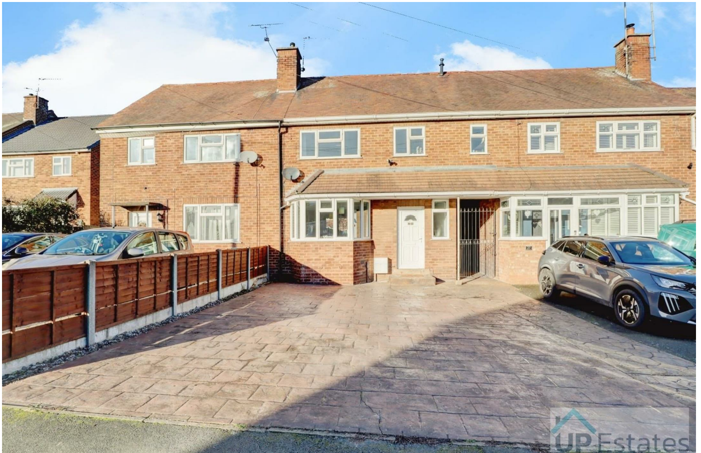
Bradestone Road, Nuneaton