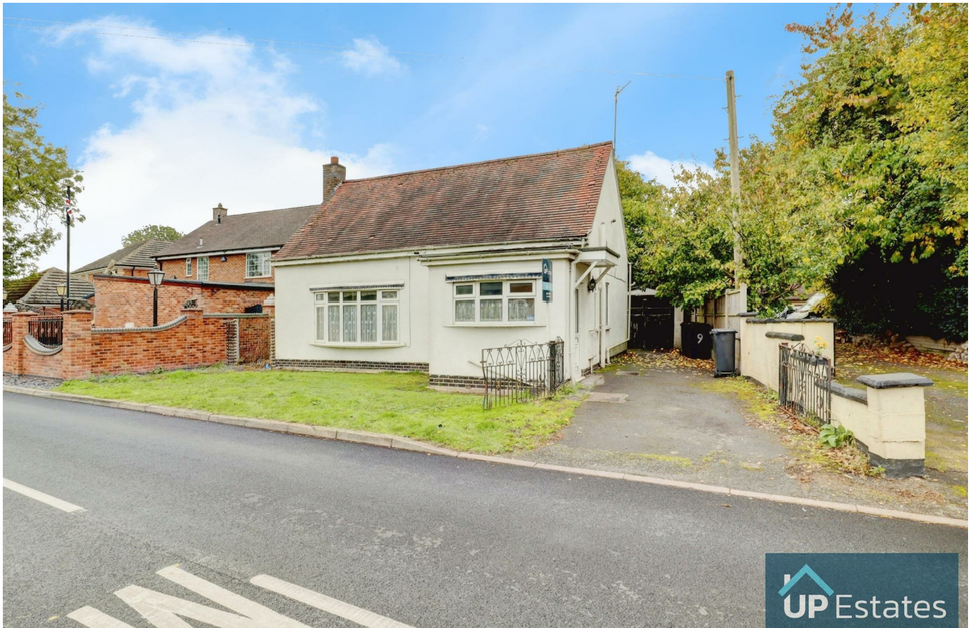
Old Forge Road, Fenny Drayton, Fenny Drayton