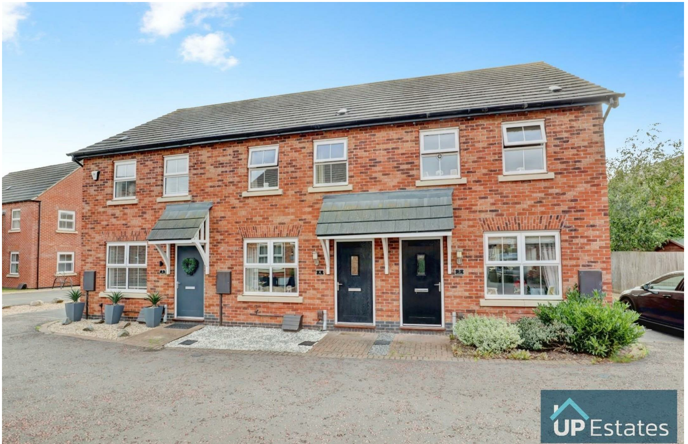
Clay Court, Measham, Measham