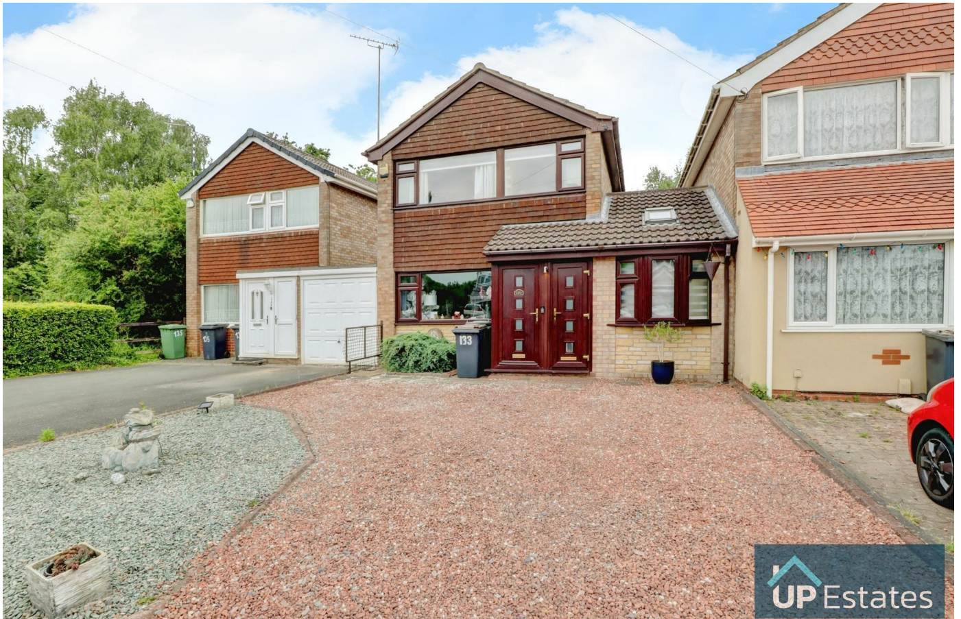
Sherbourne Avenue, Nuneaton