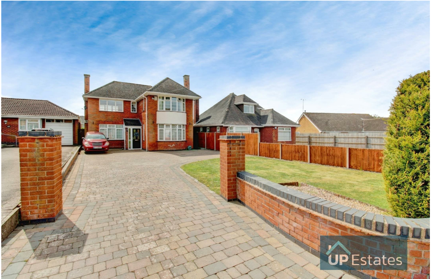
Weston Lane, Bulkington, Bedworth