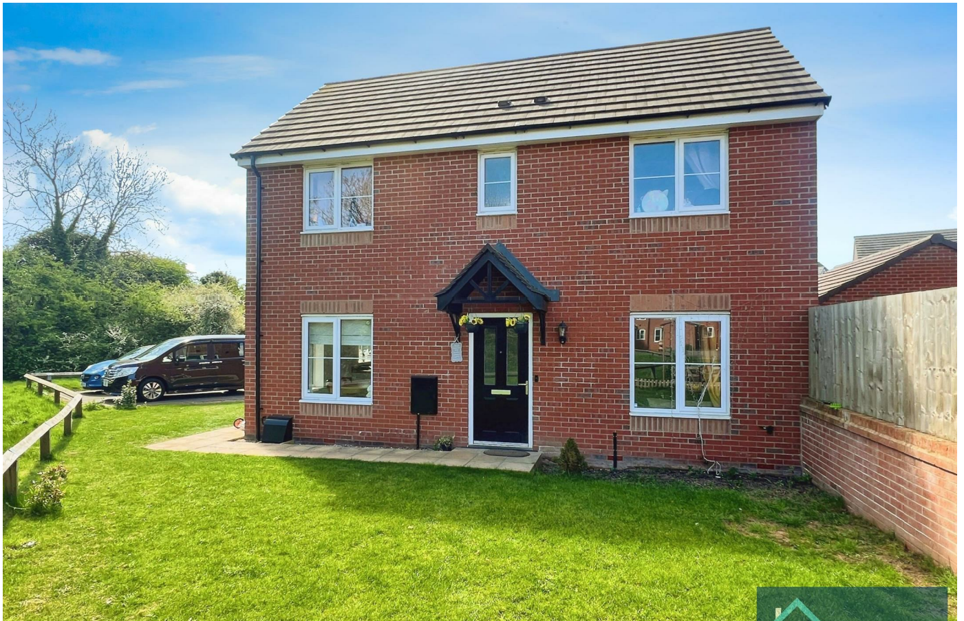
Slough Pasture, Bedworth