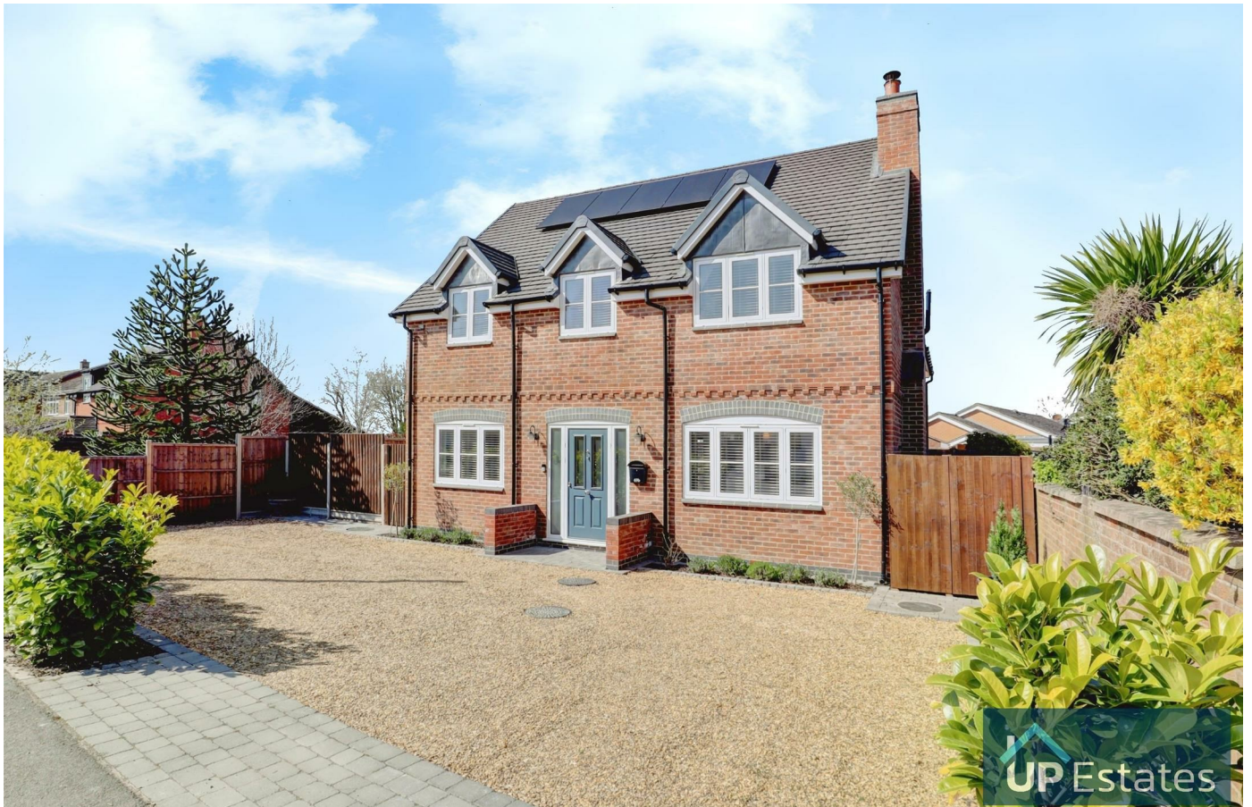
Main Street, Carlton