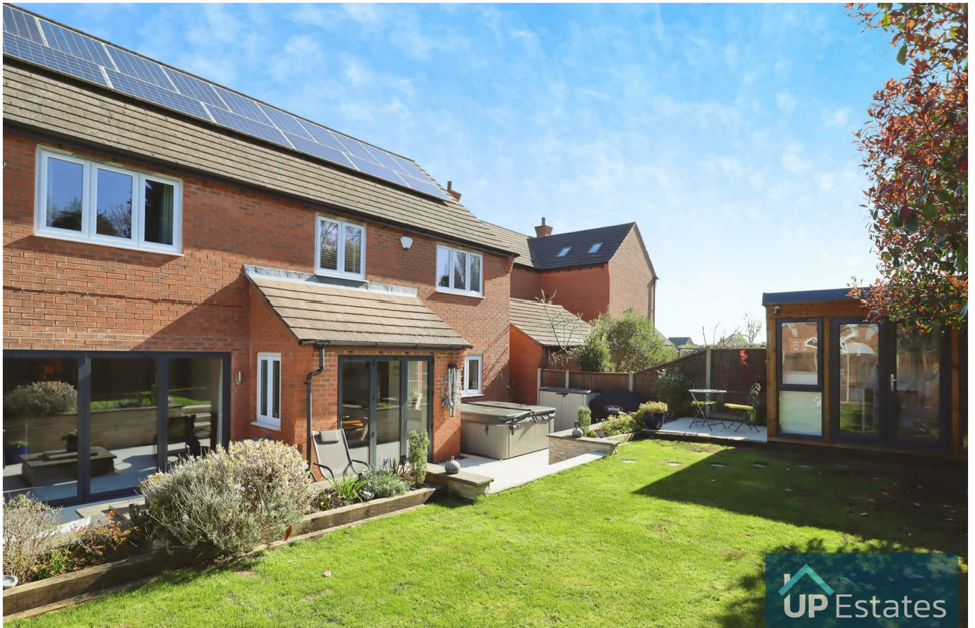
St. Louis Close, Hinckley