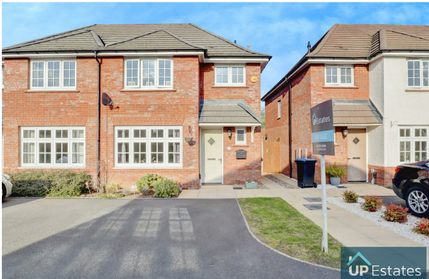
Ferry Pickering Close, Hinckley