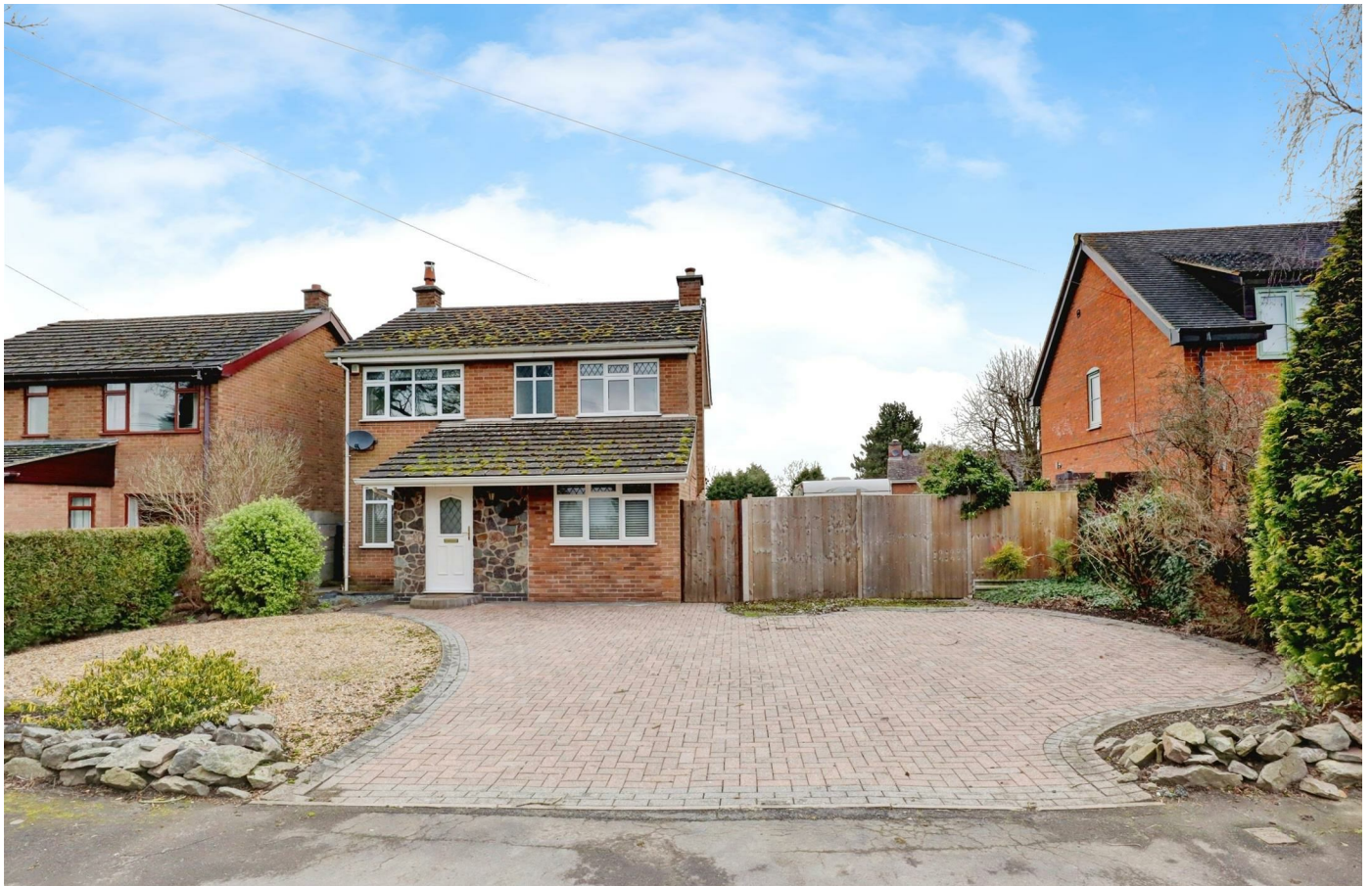
Main Street, Carlton, Nr Market Bosworth