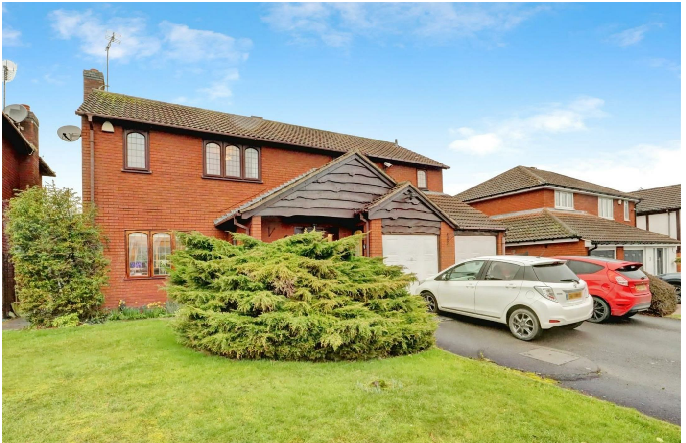
Rainsbrook Drive, Crowhill, Nuneaton