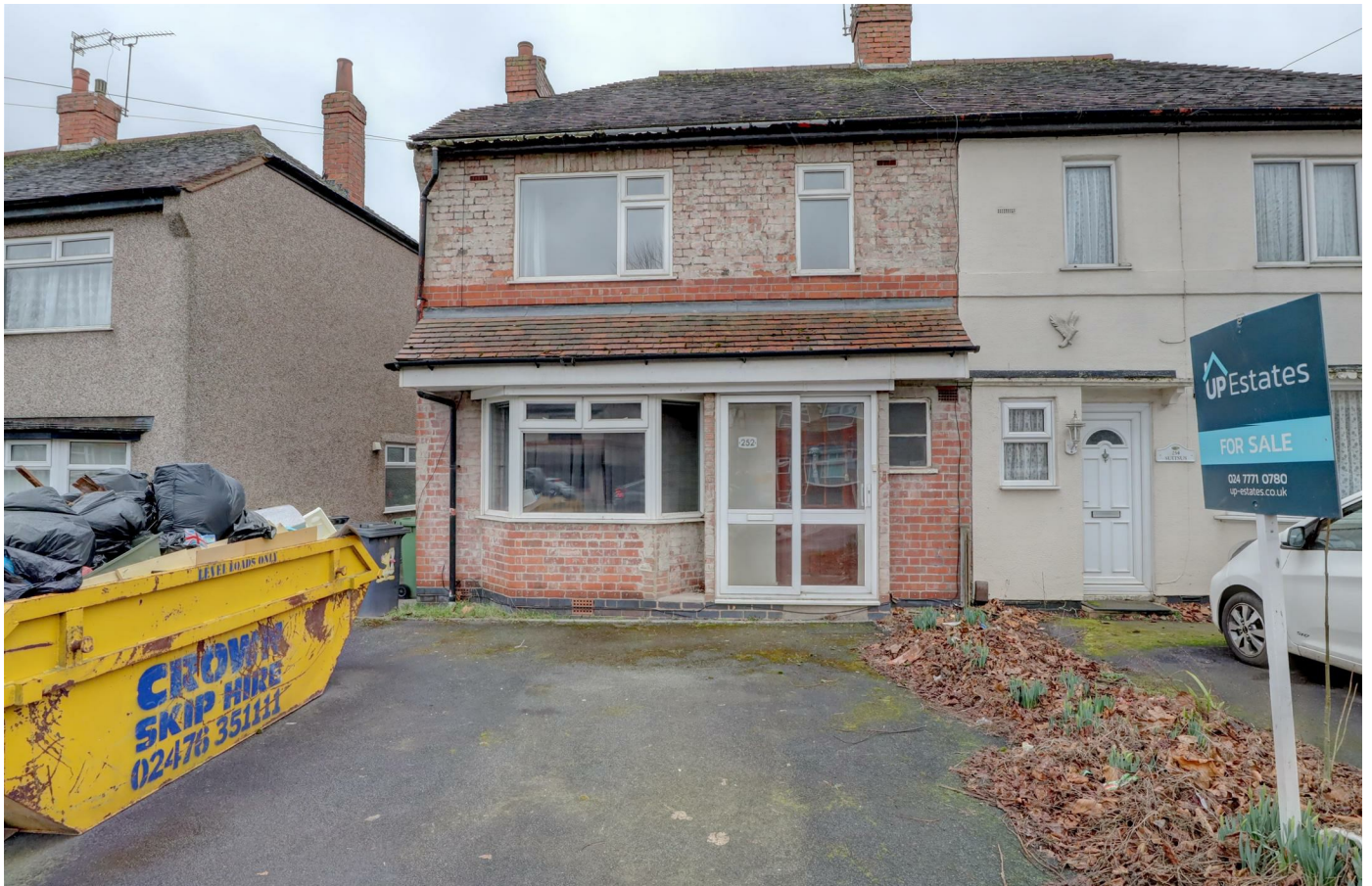
Tomkinson Road, Nuneaton