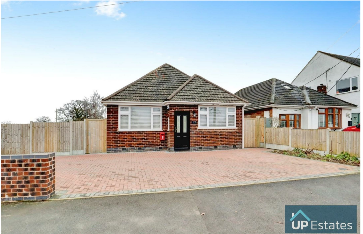
Hospital Lane, Bedworth