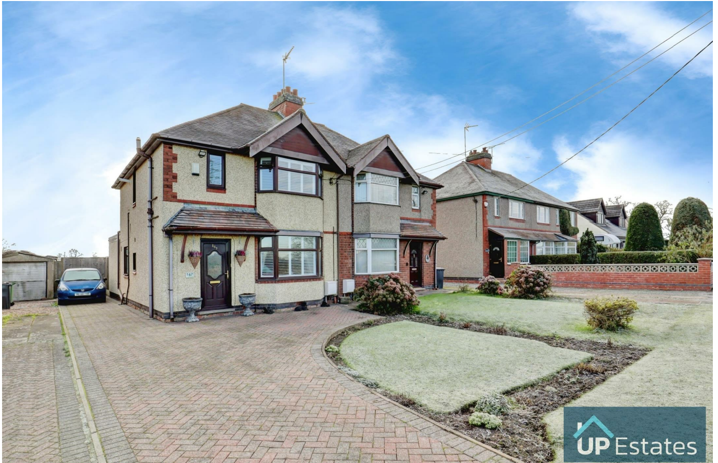
Coventry Road, Bulkington