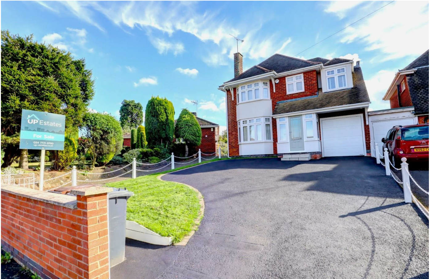
Coventry Road, Bulkington