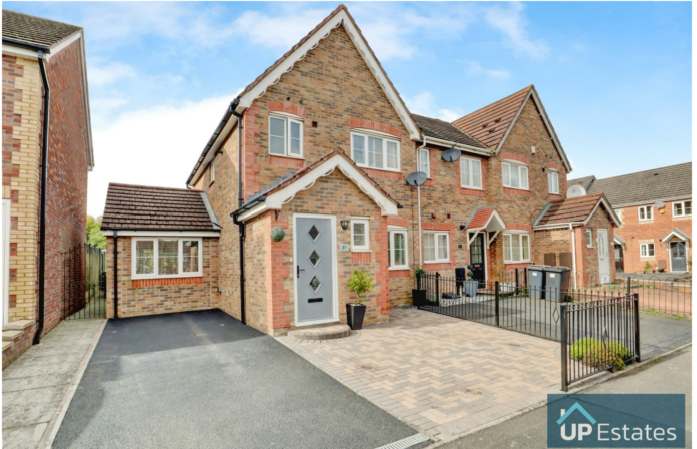
Hatters Court, Bedworth