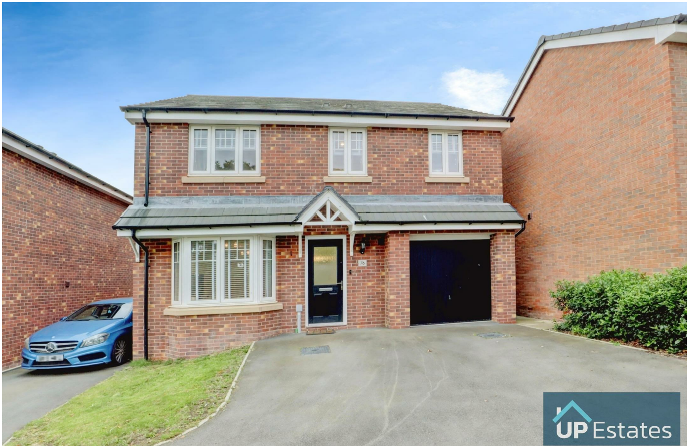
Cabinhill Road, Nuneaton