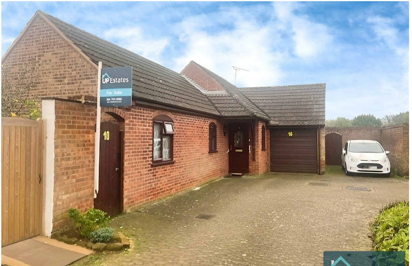
Bedworth Close, Bulkington, Bedworth