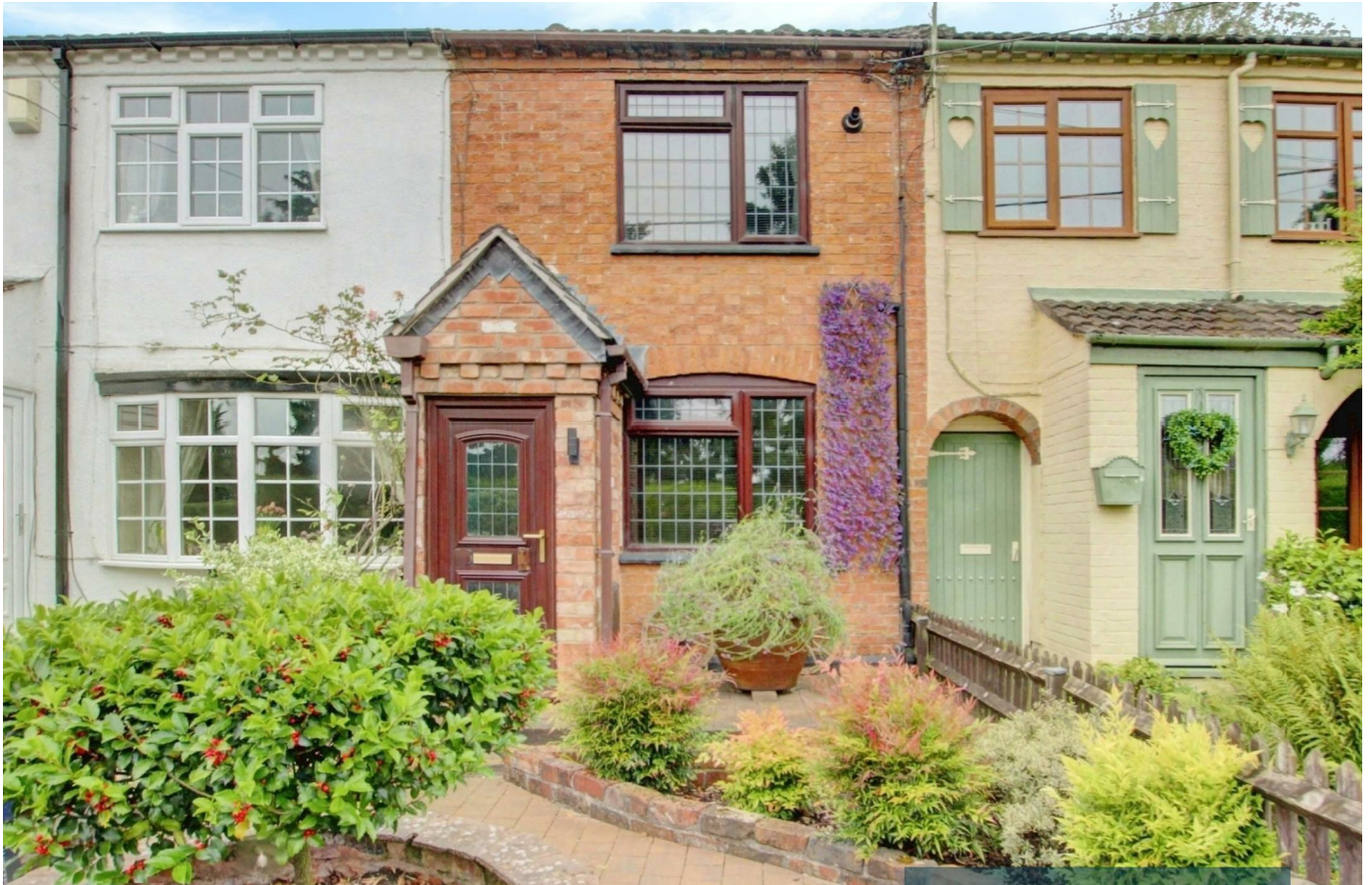
Lower Road, Coventry