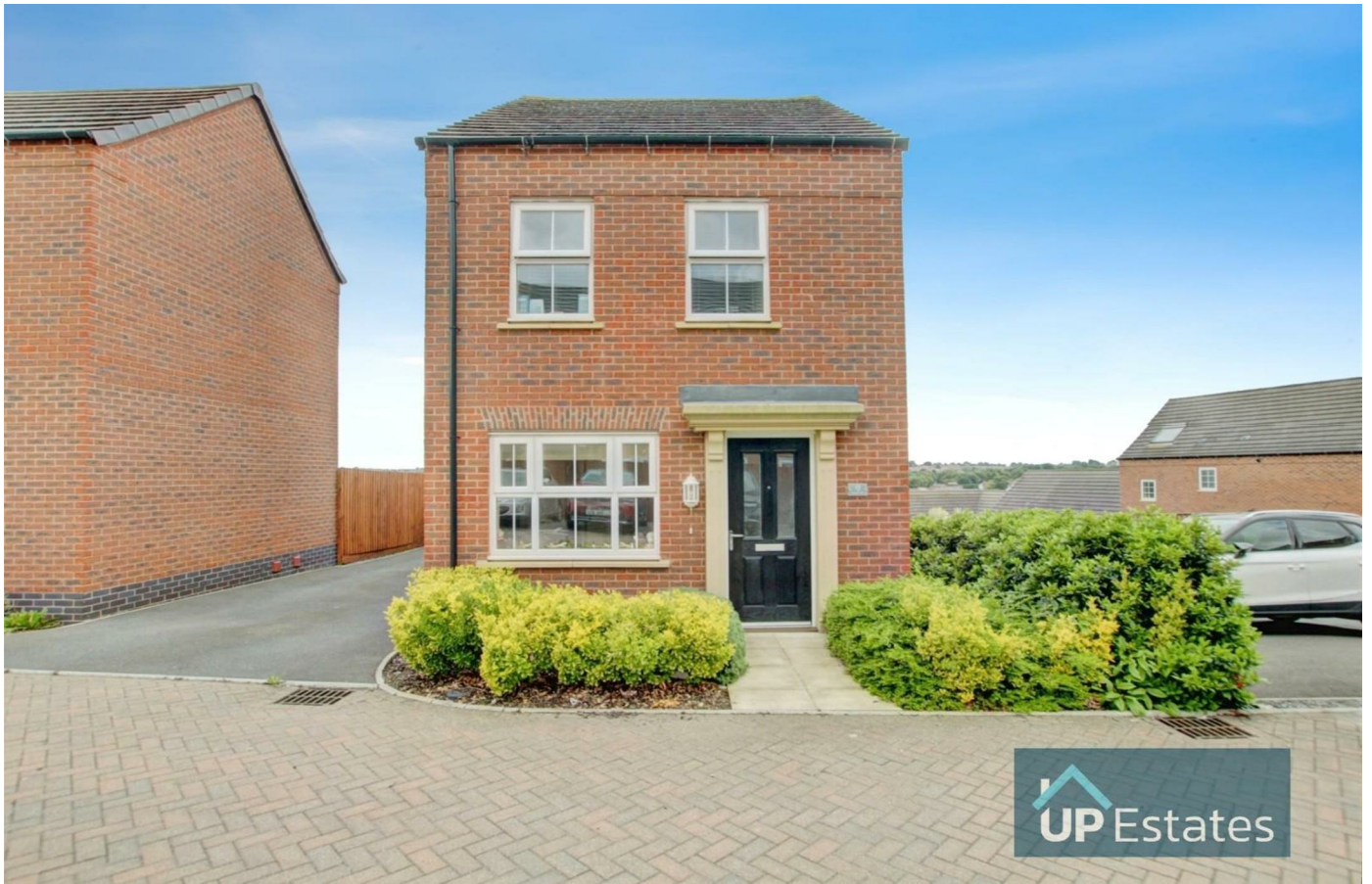
Barber Mews, Nuneaton