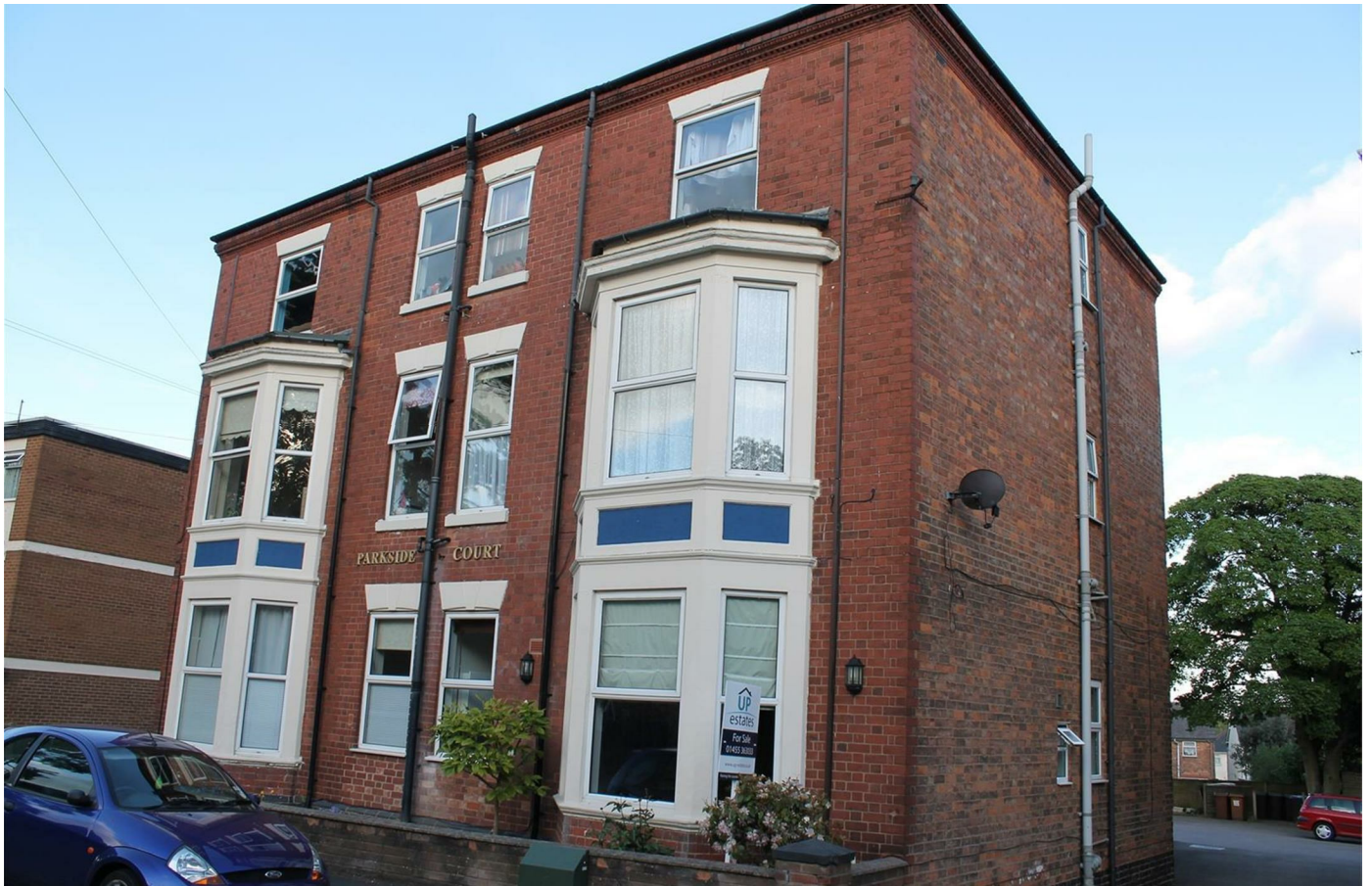
Parkside Court, Clarence Road, Hinckley