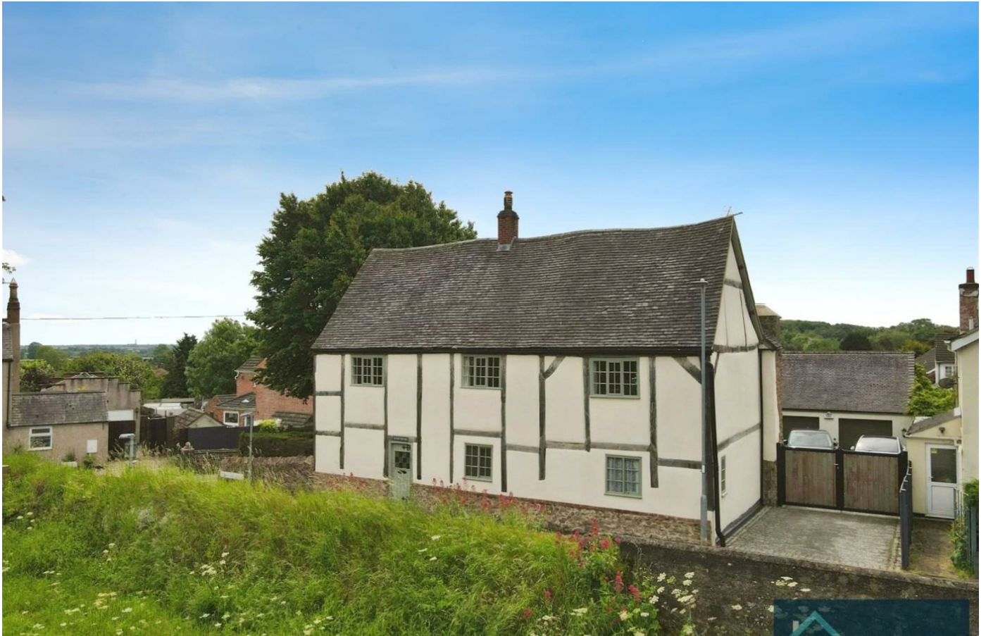
Carey Hill Road, Stoney Stanton, Leicester