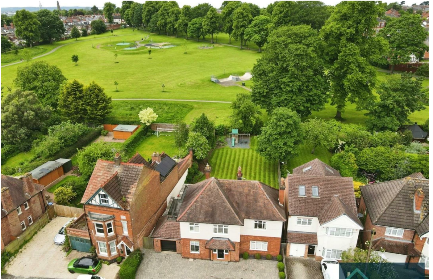
Clarence Road, Hinckley