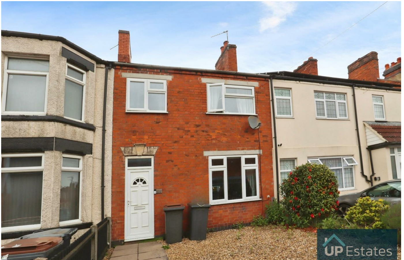
Wheat Street, Nuneaton