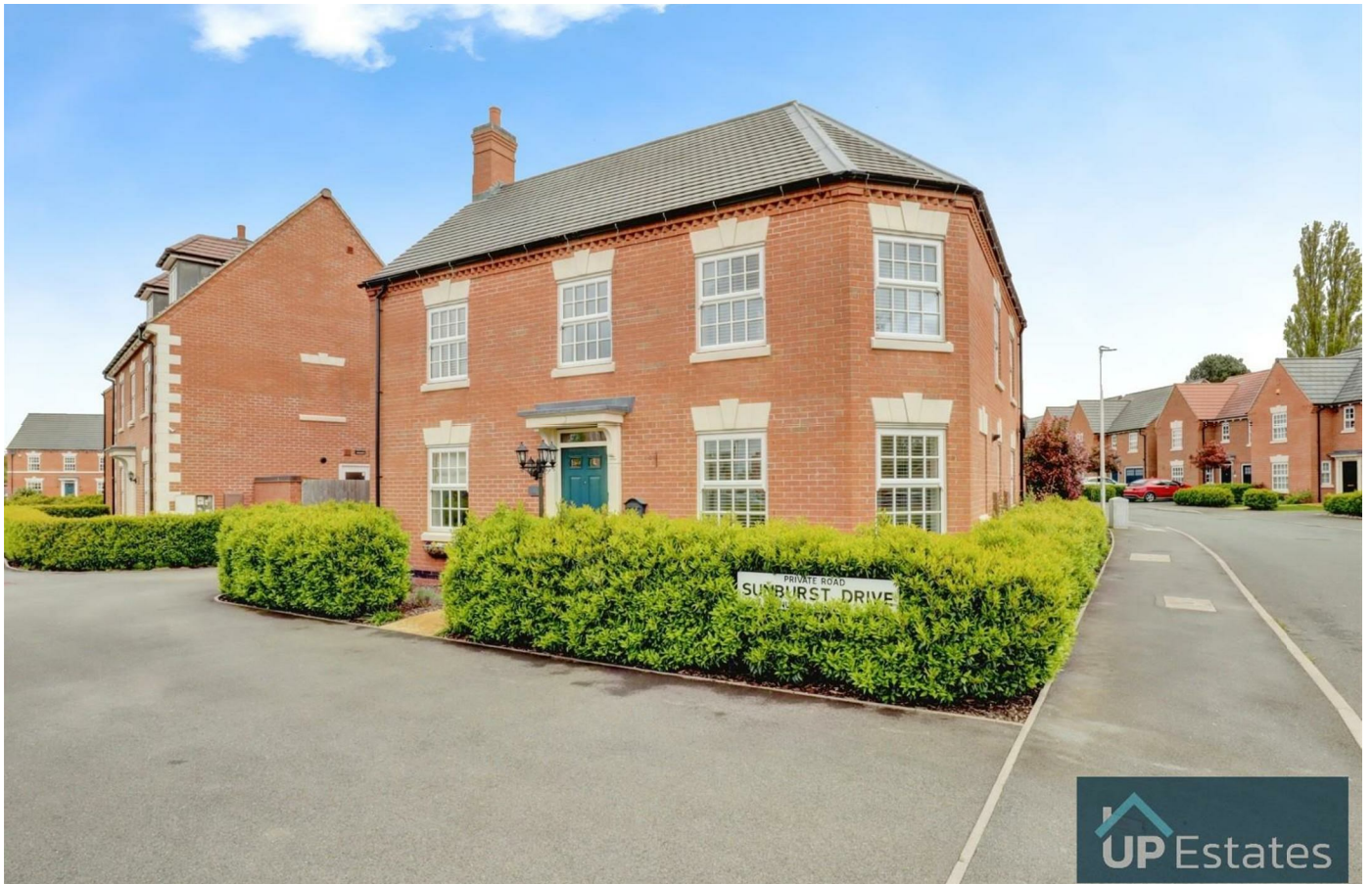
Sunburst Drive, Nuneaton