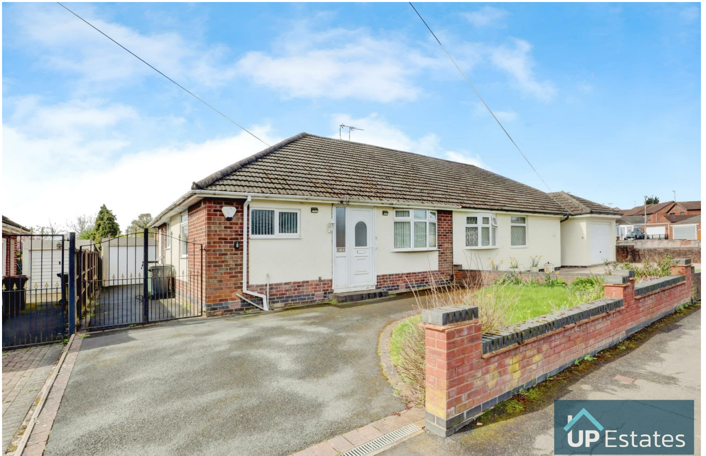
Hayes Green Road, Bedworth