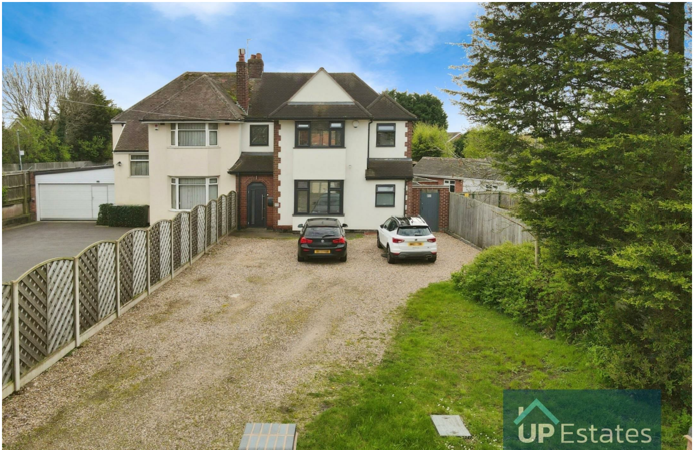
Lutterworth Road, Nuneaton