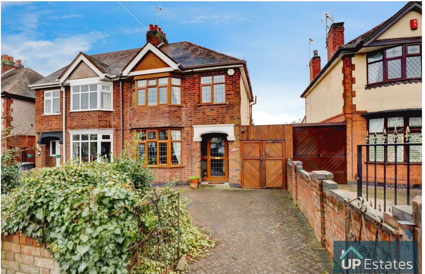
Newdigate Road, Bedworth