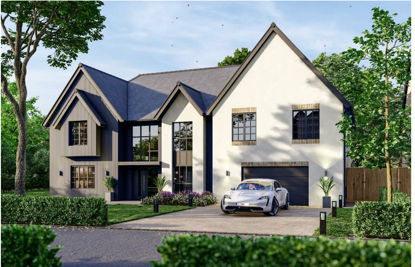
The Kilns, Breach Lane, Leicester