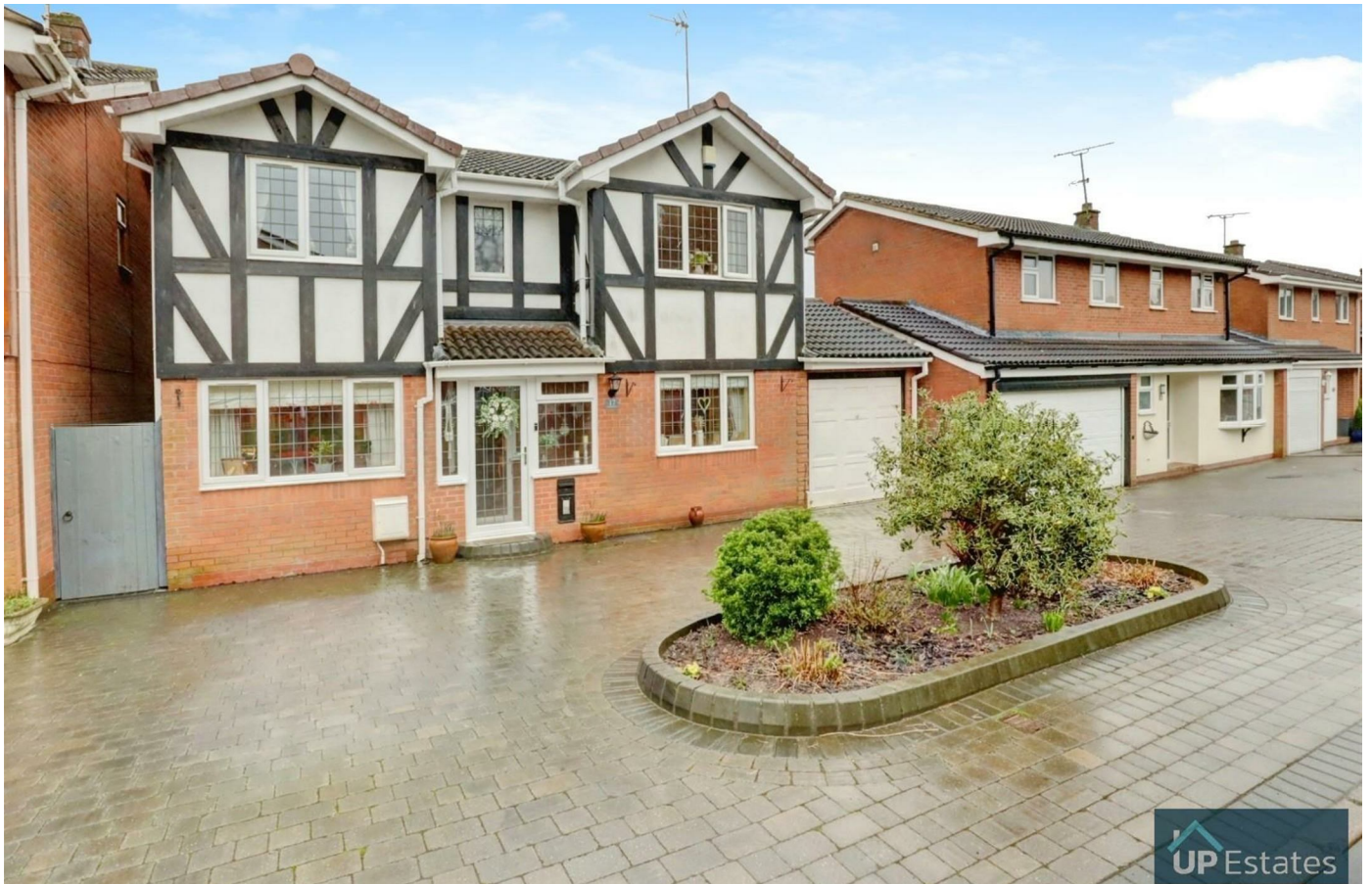
Orwell Close, Nuneaton