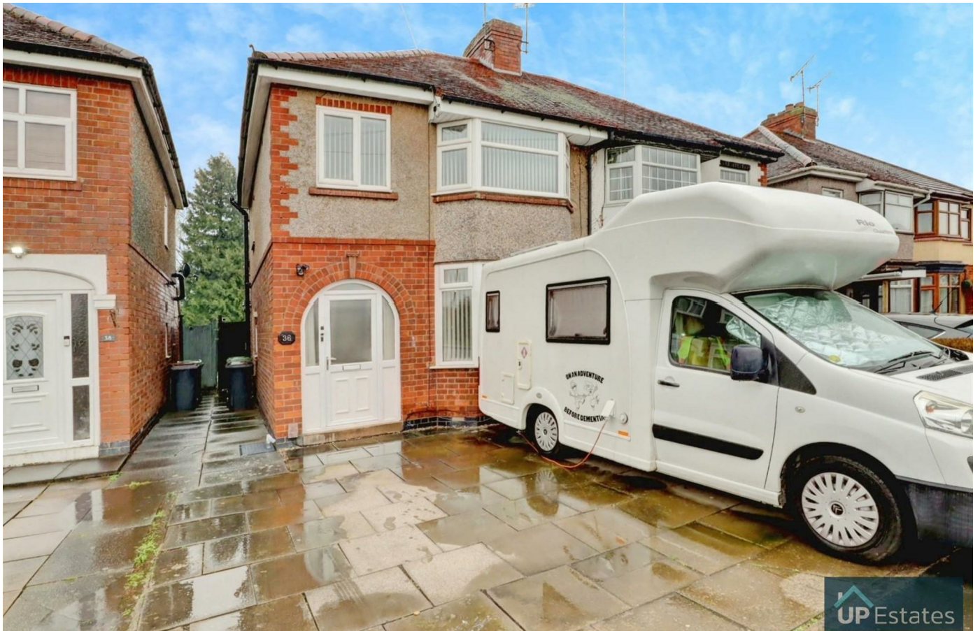
Arbury Avenue, Bedworth