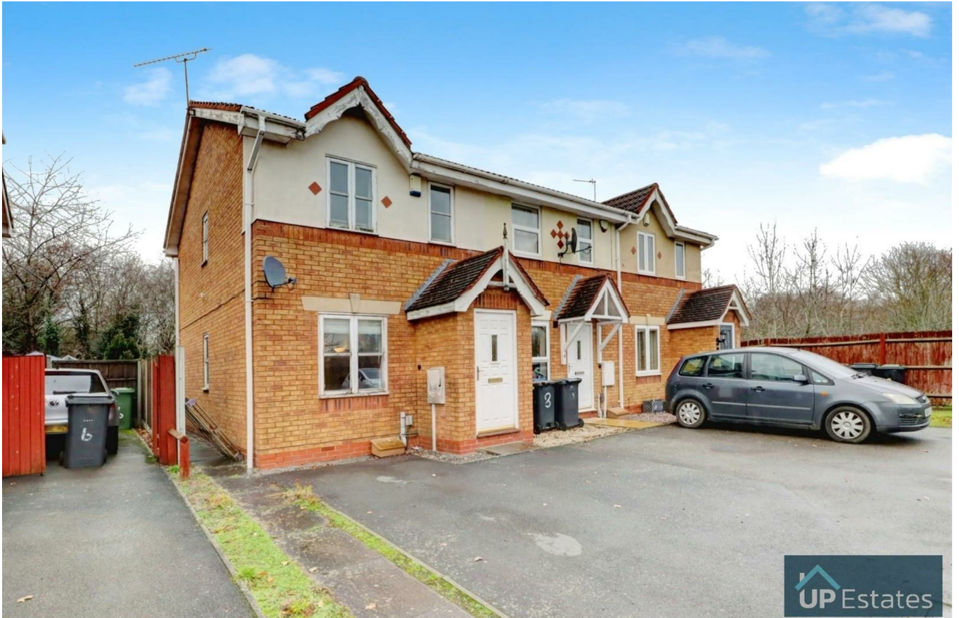
Melfort Close, Nuneaton