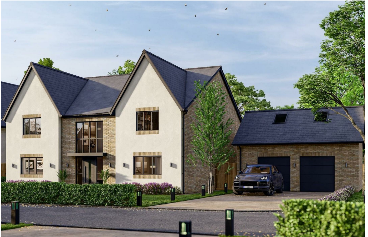
The Kilns, Breach Lane, Earl Shilton, Leicester