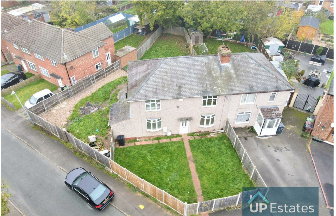
Hill Road, Keresley End, Coventry