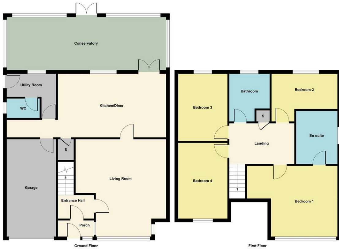
Illustration for identification purposes only, measurements are approximate, not to scale. Produced by Elements Property