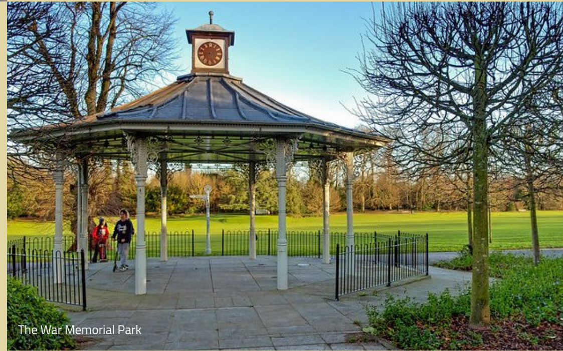
The War Memorial Park

You don't need to go far in Basingstoke to access the rolling countryside and some beautiful local pubs and restaurants, village walks and heritage sites such as Basing House.