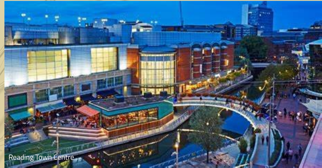
Reading Town Centre

Reading - establishing itself as a versatile hub for both shopping enthusiasts and entertainment seekers. The Oracle Shopping Centre stands as a testament to its commitment to top-tier retail experiences and delightful culinary adventures. However, Reading extends beyond its shopping and dining allure, offering a vibrant nightlife with an array of bars and entertainment options, catering to varied tastes, from jazz clubs to upscale dining and quaint microbreweries. The town's cultural vibrancy is further heightened by iconic events like the Reading Festival, which annually attracts globally renowned artists. Reading takes pride in not only its cultural offerings but also its involvement in sports, with the Madejski Football Stadium hosting matches that unify the community. The town's commitment to fitness is exemplified by the renowned Reading half marathon, drawing participants from diverse backgrounds to partake in this exhilarating event. As Reading celebrates its versatility, it remains a dynamic and engaging community for residents and visitors alike.