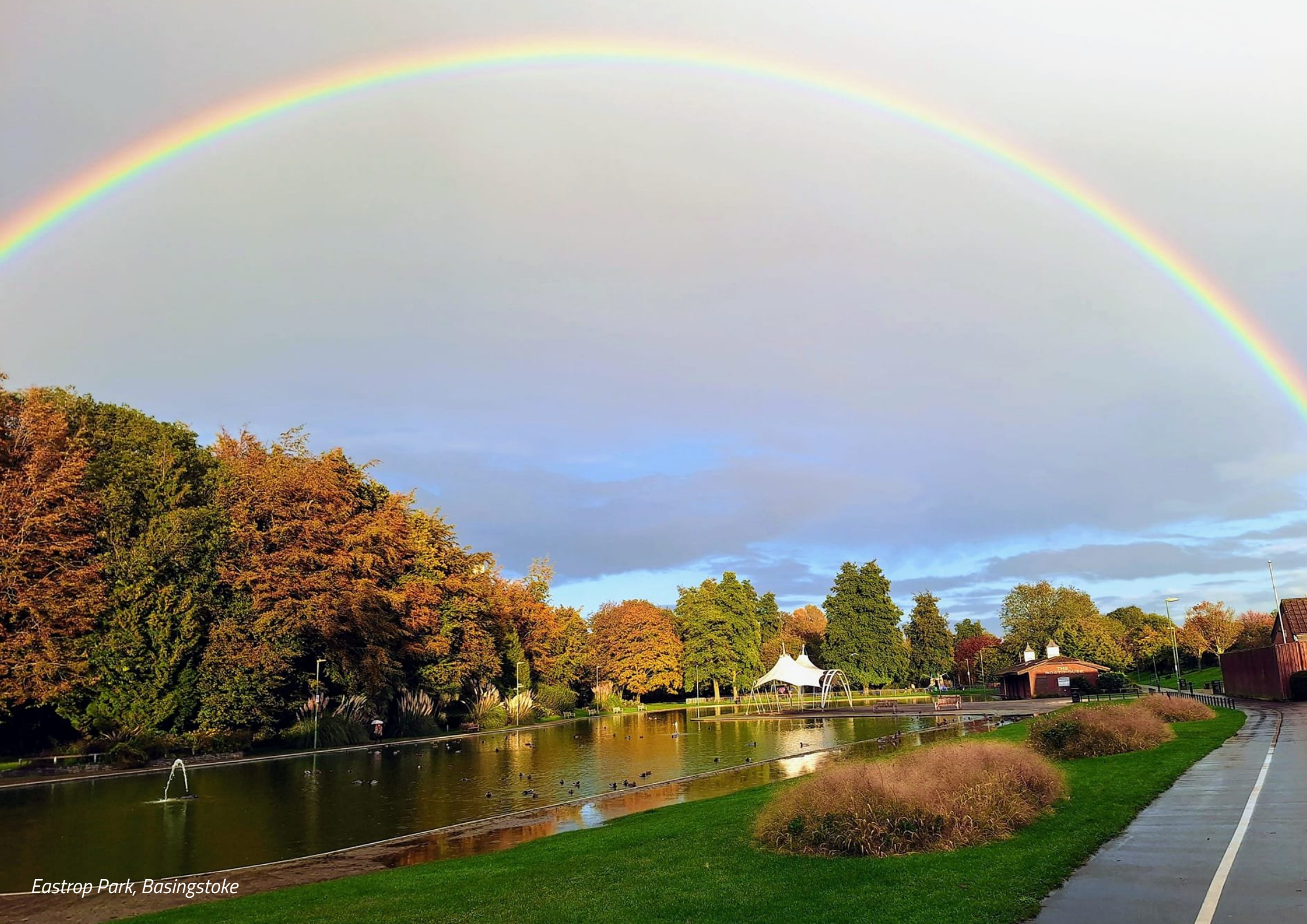
Eastrop Park, Basingstoke