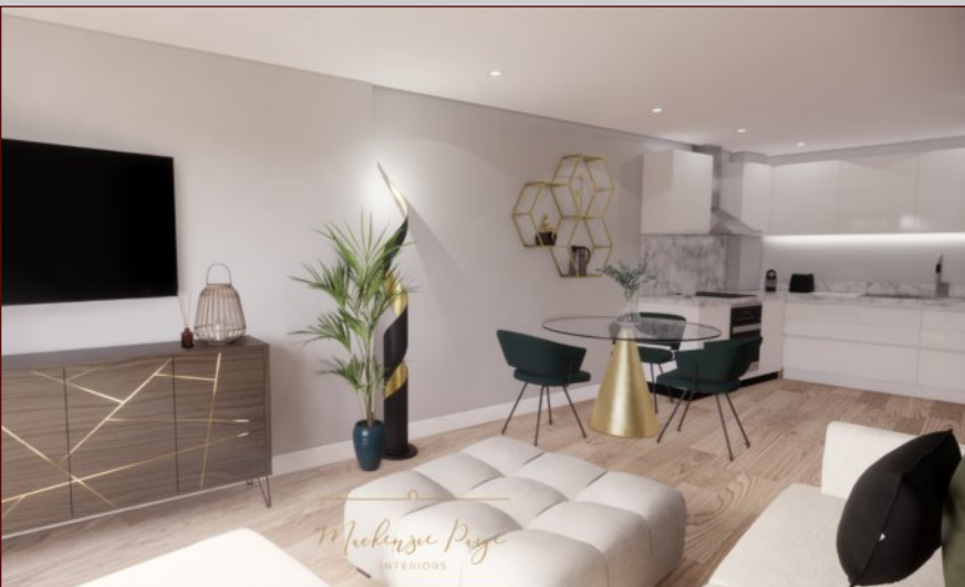
Apartments do not come with furnishings; CGI's are provided solely for visual representation'