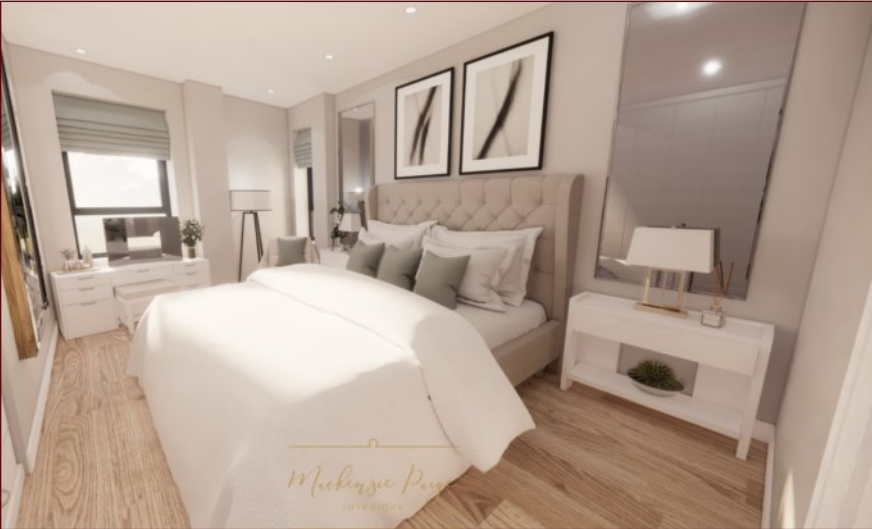
Apartments do not come with furnishings; CGI's are provided solely for visual representation'