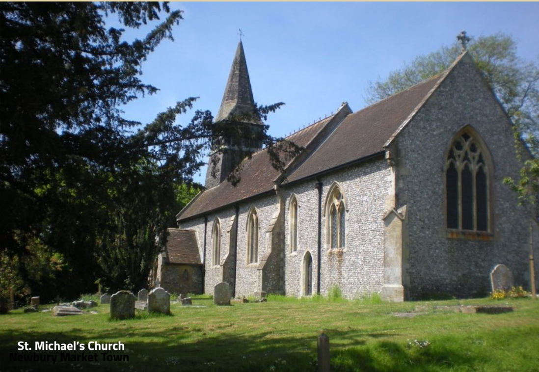
St. Michael's Church Newbury Market Town

North Waltham - a charming village located on the outskirts of Basingstoke in Hampshire, is a quintessential slice of rural England. At its core, you'll find a delightful local shop, a picturesque church steeped in history, and a Victorian-era primary school that has been the foundation of education for generations. The Village Trust takes pride in maintaining Cuckoo Meadow and Rathbone Pavilion, two idyllic spots where the community gathers for leisure and recreation. Here, you can indulge in a game of tennis or watch the laughter of children echoing from the well-kept playground. But what truly defines North Waltham is its natural surroundings. Surrounded by the breathtaking expanse of open countryside, the village invites you to explore its network of bridle paths, where you can embark on leisurely walks, soaking in the sheer beauty of the local landscape. North Waltham is a place where modern convenience meets the timeless allure of the countryside