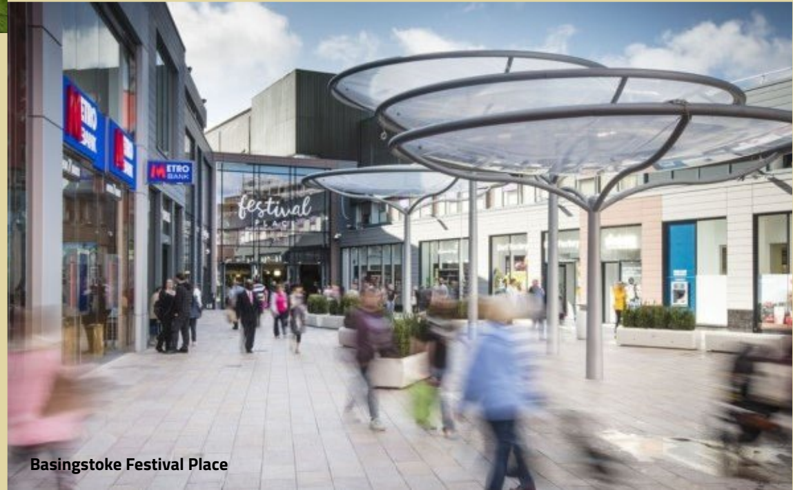
Basingstoke Festival Place

Due to Basingstokes thriving economy, the town houses many large private and public sector companies, including The AA, BNP Paribas Leasing Solutions, AXA Wealth, Lenovo, De La Rue Plc, Sainsbury's, Sun Life Financial of Canada, Network Rail Training Centre, GAME, Sony Europe and Fujitsu Services.