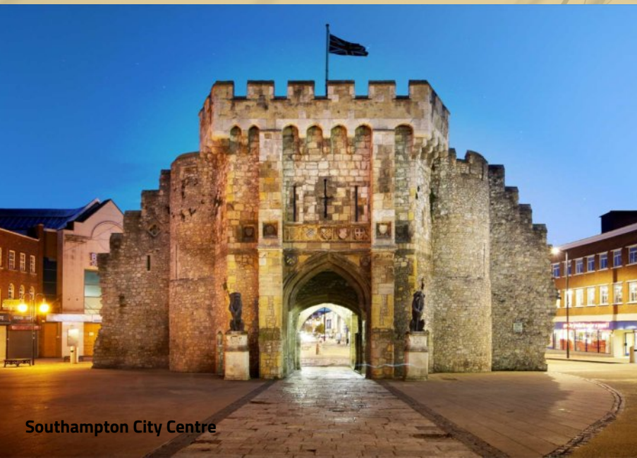
Southampton City Centre

Southampton - Southampton, located in Hampshire, England, is a prominent port city and one of the most densely populated urban centres in southern England. Its historical significance is underscored by its role as the departure point for the ill-fated RMS Titanic, a sombre chapter in maritime history. This city has a rich and varied past, having endured the devastating Southampton Blitz during World War II when it suffered heavy bombing. Southampton is also associated with the renowned author Jane Austen, who called it home for a significant period of her life. Today, Southampton thrives as a vibrant and modern city, offering a plethora of leisure activities for residents and visitors alike. The options are diverse, ranging from dining experiences at a multitude of eateries, state-of-the-art cinema complexes, and extensive shopping centers to a vibrant nightlife scene. Southampton seamlessly blends its storied past with its dynamic present, making it a compelling destination for both history enthusiasts and those seeking contemporary entertainment and culture.