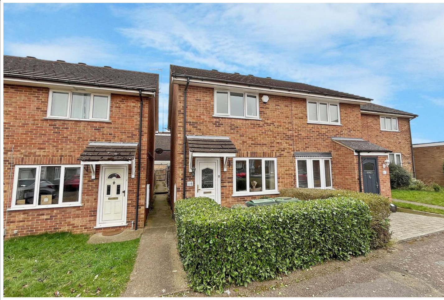
Windermere Close, Flitwick, Bedfordshire, MK45 1NQ