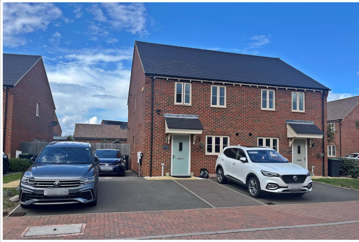
Windmill View, Houghton Conquest, Bedfordshire MK45 3GD