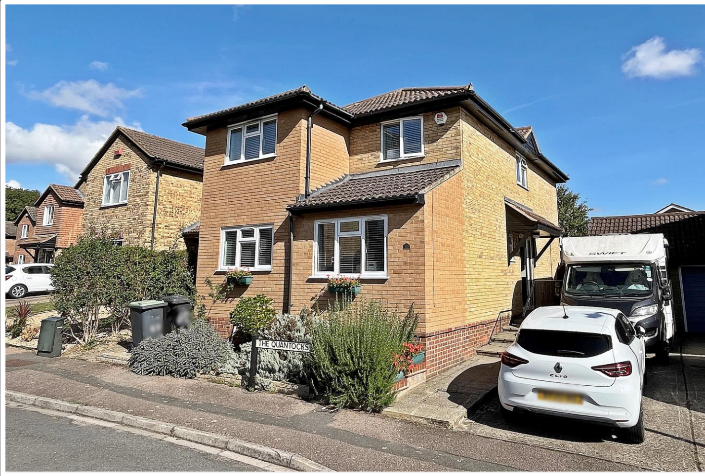
The Quantocks, Flitwick, Bedfordshire, MK45 1TG