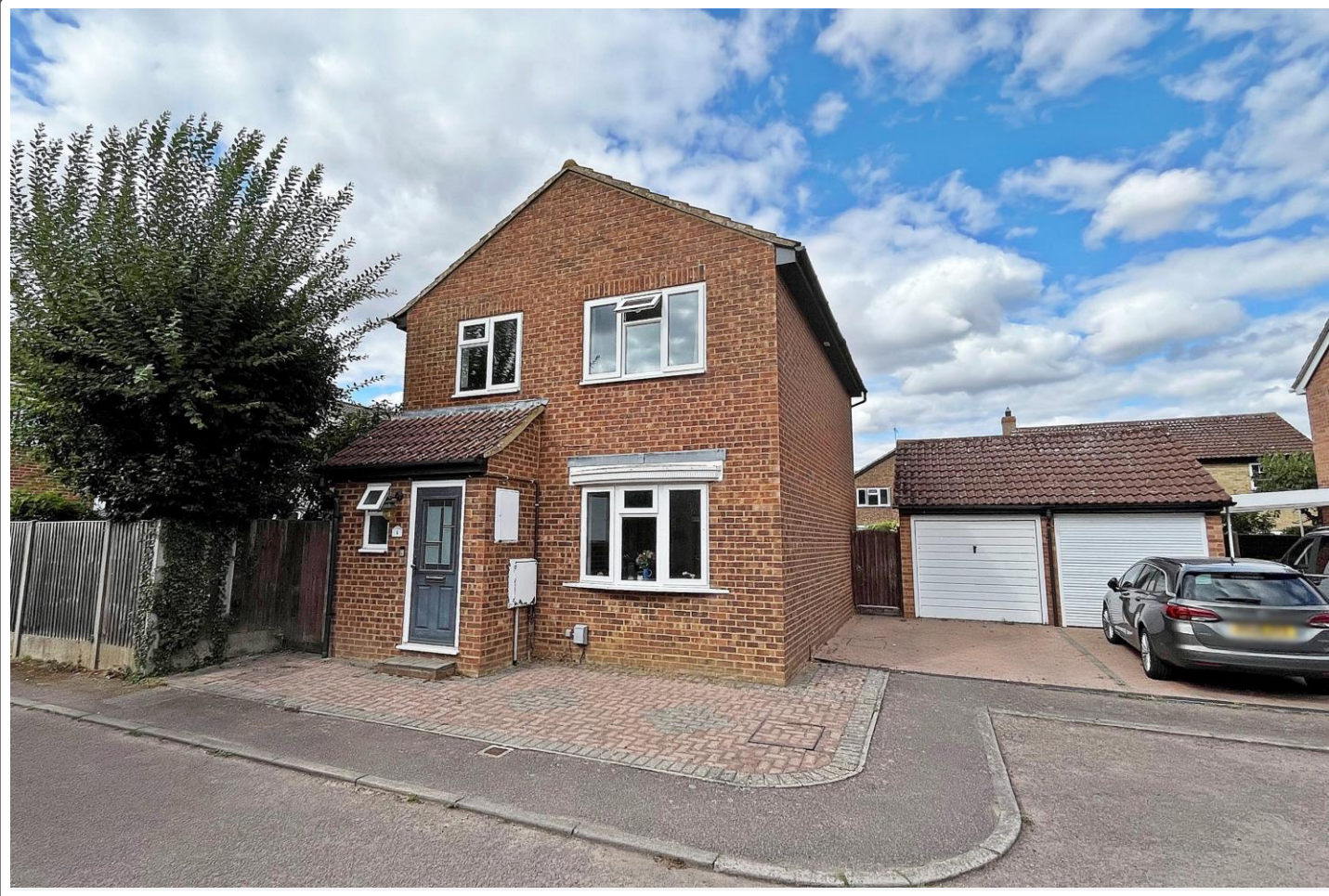
Buckingham Mews, Flitwick, Bedfordshire, MK45 1TB