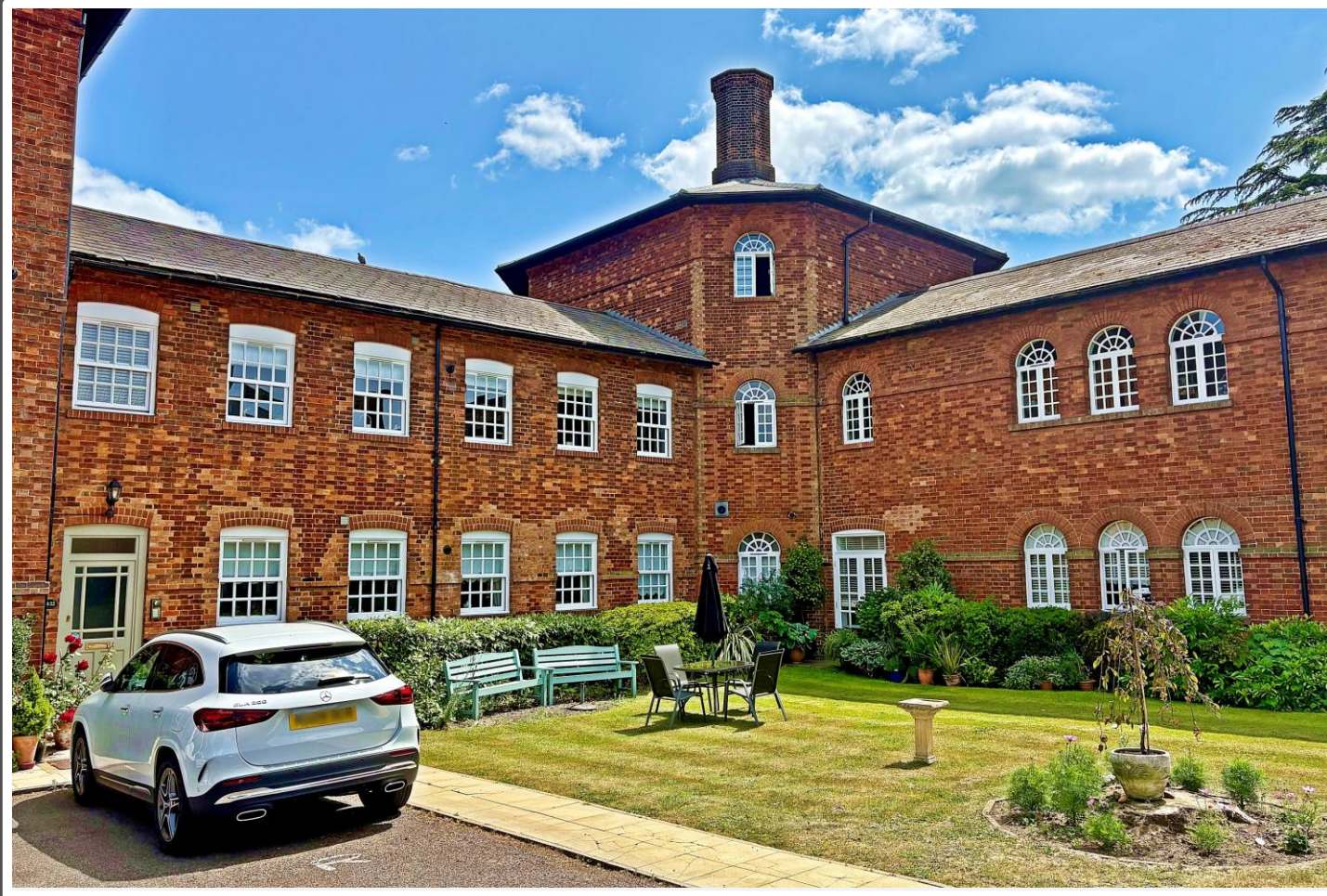
The Cedars, Dunstable Street, Ampthill, Bedfordshire, MK45 2JZ