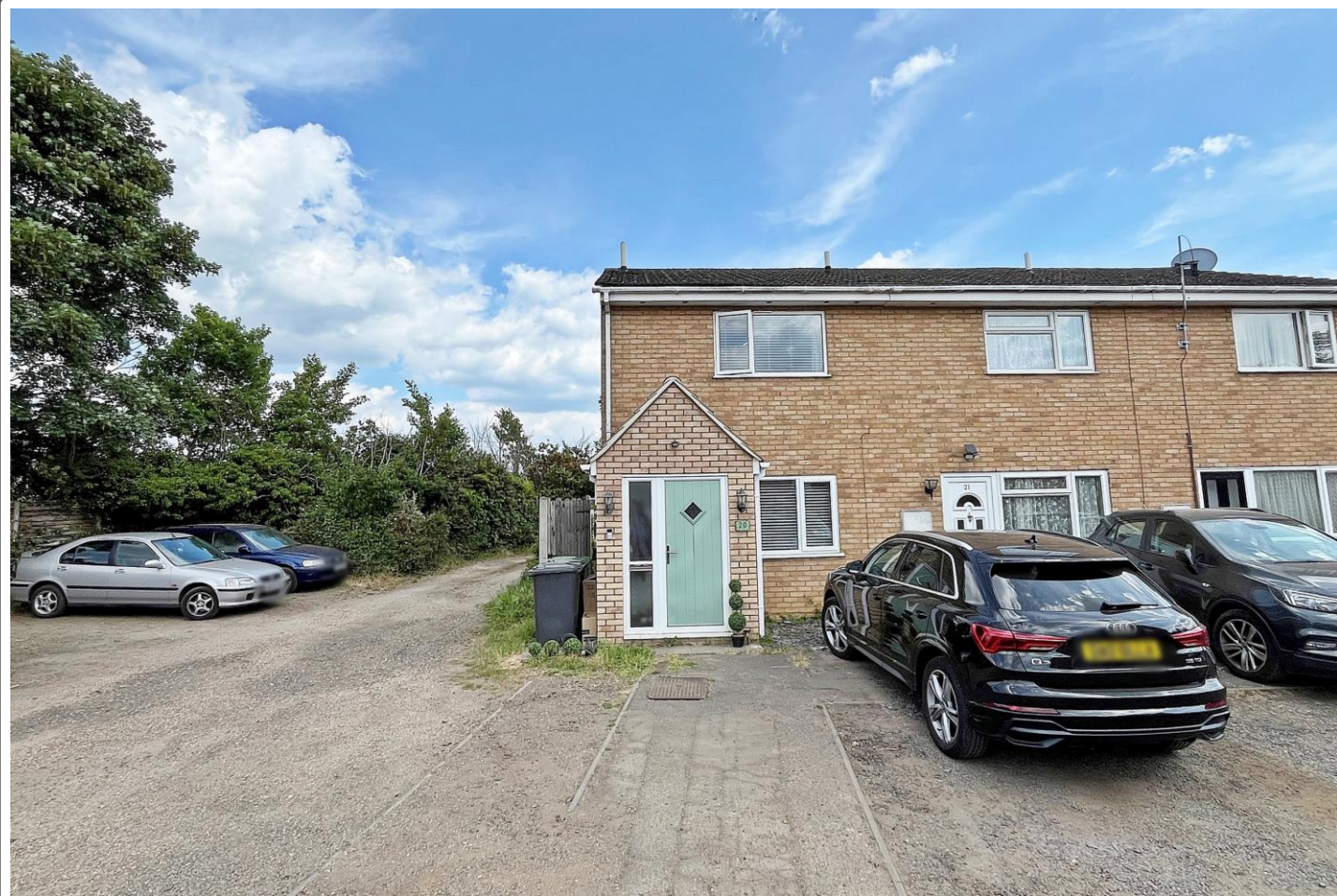
Dunstable Close, Flitwick, Bedfordshire, MK45 1JN