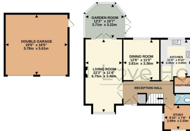
GROUND FLOOR 1179 sq.ft. (109.5 sq.m.) approx.