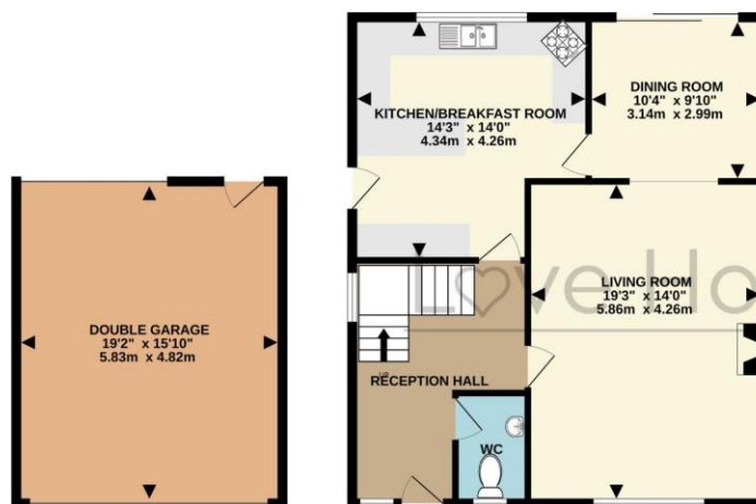
GROUND FLOOR 1007 sq.ft. (93.5 sq.m.) approx.