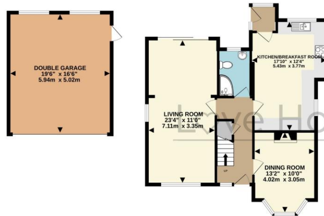
GROUND FLOOR 1030 sq.ft. (95.6 sq.m.) approx.