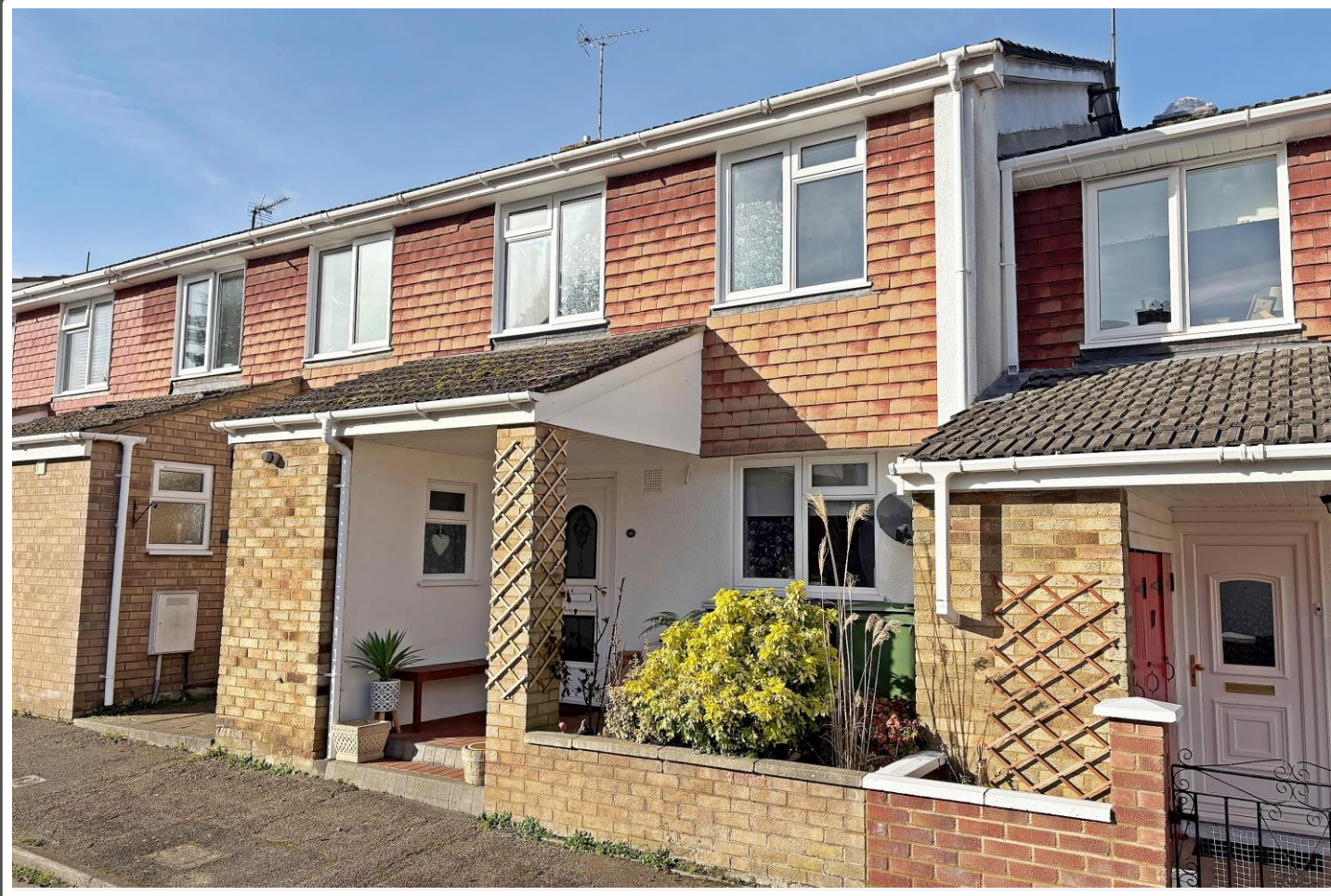
St Margarets Close, Lidlington, Bedfordshire MK43 0RL