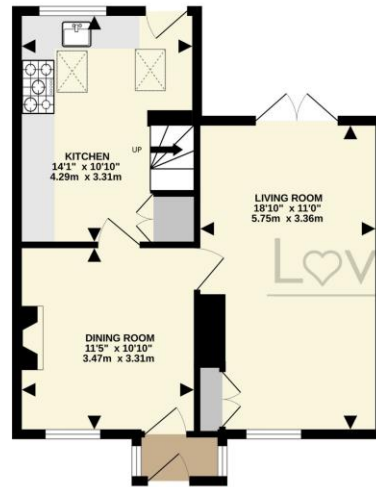
GROUND FLOOR 484 sq.ft. (45.0 sq.m.) approx.