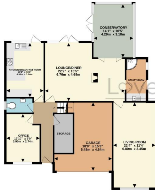
GROUND FLOOR 1369 sq.ft. (127.2 sq.m.) approx.